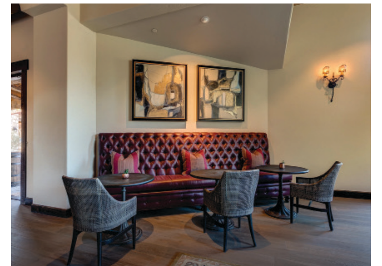
SETTEE — CORNER SPACE