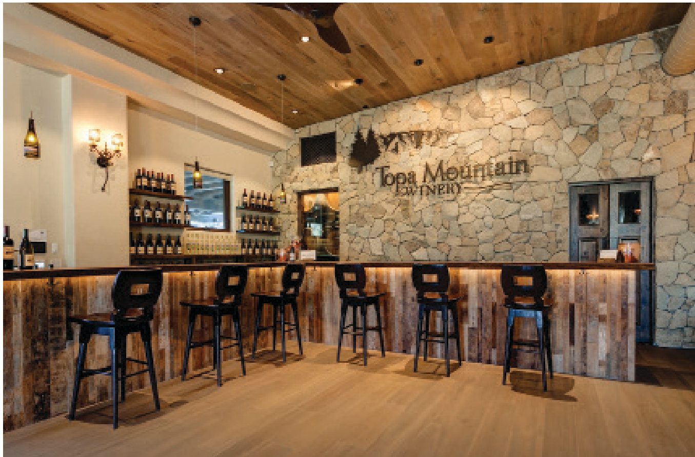
TOPA MOUNTAIN WINERY BAR